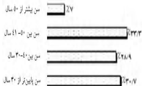
۱- توزیع فراوانی سن کارشناسان