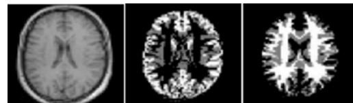
( ) MR

( [ ] ) MI (FWHM) ) MRI fMRI ( ) [ ] MRI ( WM) ( GM) (CSF) [ ] " " MRI ( ) [ ] SPM5 T test F test BOLD BOLD fMRI ([ ] (MNI) CSF WM GM) HRF ( ) [ ] (F2 F1 N2 N1) SPM5 ( ) × ۱۵ CSF WM GM WM GM T test F test CSF WM GM MRI F test T test T test ( ) MR F test .CSF WM GM ) T test fMRI F ( ) ( ) fMRI